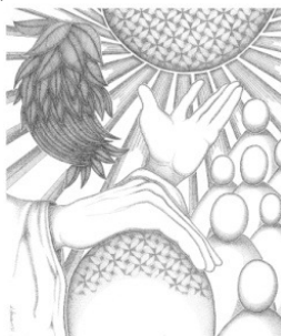
Vision

Being the authentic Body of Christ, by receiving God's love and abundant life, Through the power of the Holy Spirit, To reach, gather, welcome, heal and serve others so that Christ is lifted up.